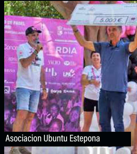
Asociacion Ubuntu Estepona