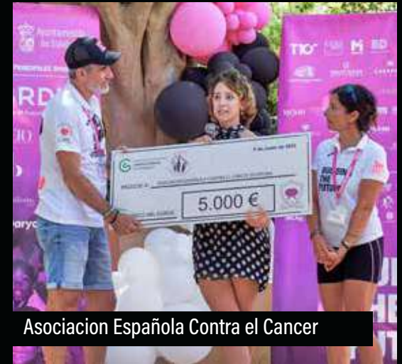
Asociacion Española Contra el Cancer