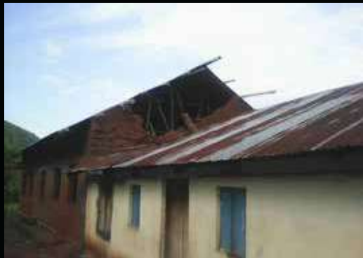
In this photo, you can see the two buildings next to each other that we rebuilt at the beginning and the wooden one on the right that was the one we replaced in 2021.

Torrential rains had destroyed the first school building that we had partially repaired with the help of friends, family, markets, etc... Thanks to the Solidarity Tournament we were able to finish this school pavilion as well as the building attached to it that had to be expanded and the roof raised. We also put drinking water through a tank that was filled by rainwater pipes, solar panels, toilets and furniture for the school.