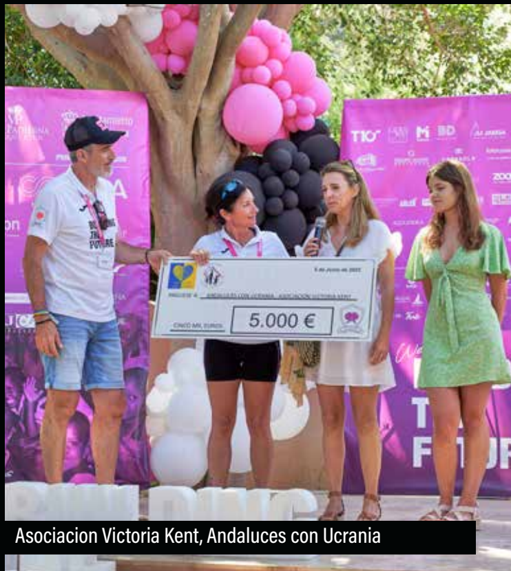
Asociacion Victoria Kent, Andaluces con Ucrania