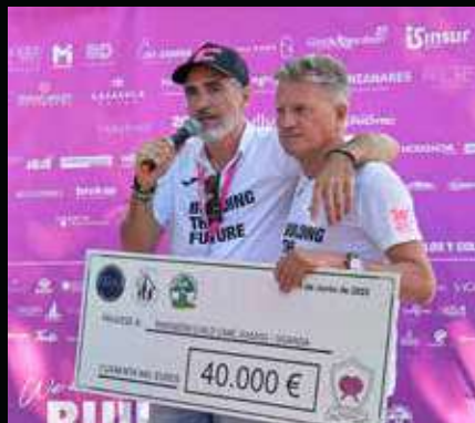
Proyecto Rwenzori Child Care, Colegio en Uganda