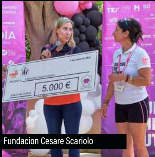
Fundacion Cesare Scariolo

40,000€ were allocated to the construction of a fourth classroom pavilion at our school in Uganda to increase the number of students who can attend school in safe and comfortable conditions from 240 to 350.